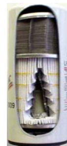
Combination filtration with patented Venturi Nozzle