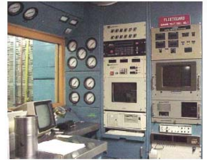
Real World testing facility in Cookeville, TN

Cummins Filtration has the most resources dedicated to research and development in the industry today. Fleetguard™ lube filters are designed, based on this real world on-engine testing, to provide the optimal levels of efficiency, capacity and cold flow ability. Fleetguard™ oil filters are designed to meet or exceed the original equipment specifications for service intervals and as a result, provide the best engine protection.